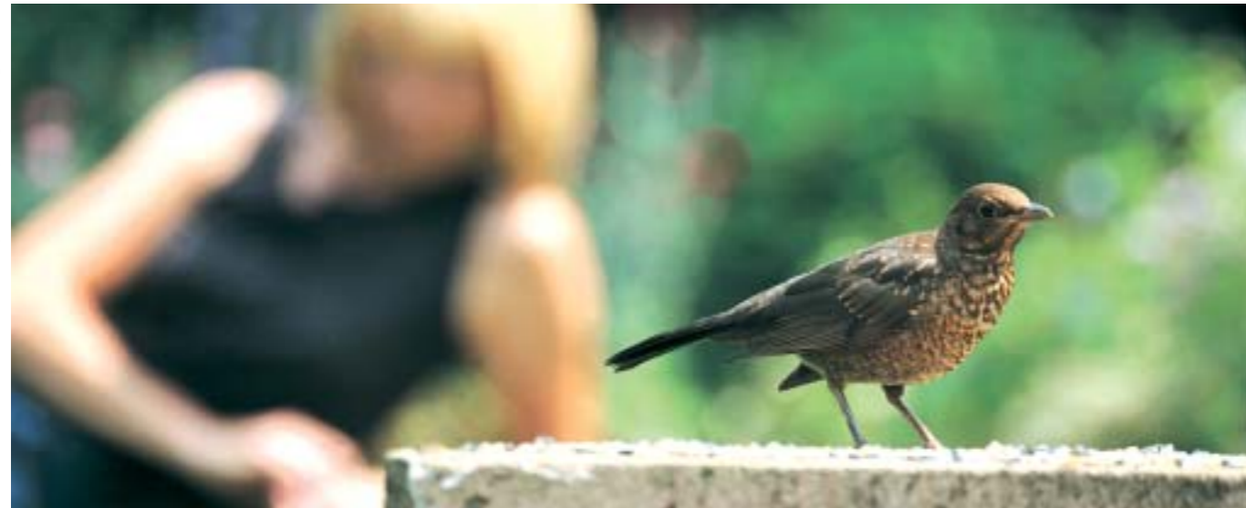
Garden birds, such as this young blackbird, are always popular: our surveys of such species enthuse hundreds of thousands of people.