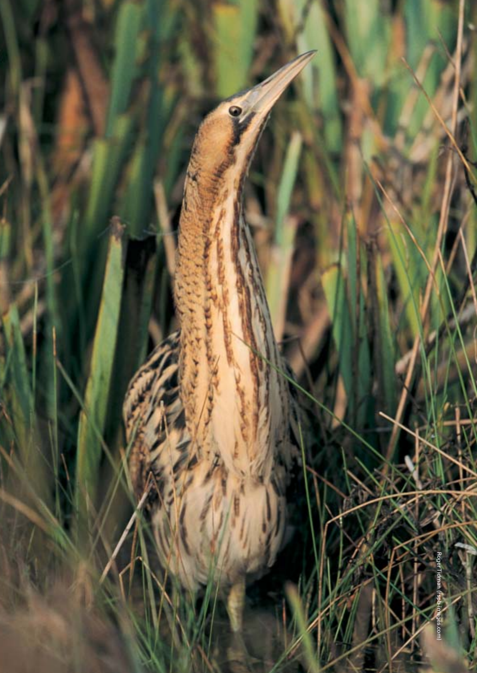
Roger Tidman (rspb-images.com)

It was, with some notable exceptions, a good year for wild birds in 2004–2005.