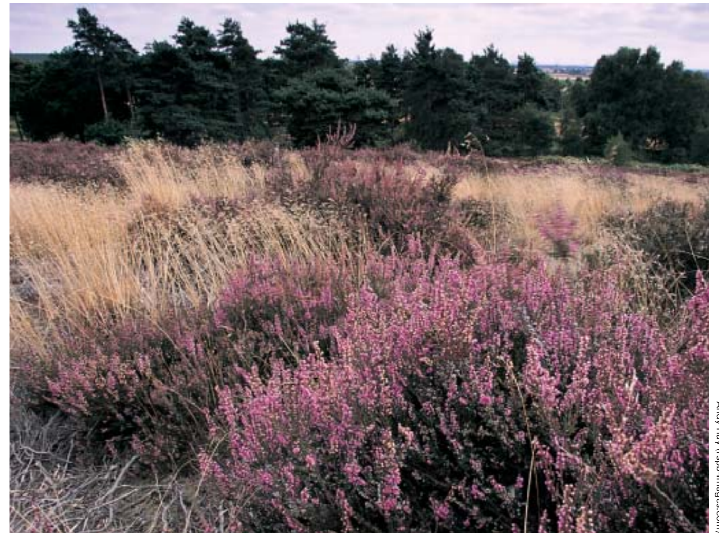
At The Lodge nature reserve in Bedfordshire we have acquired new areas of land to extend the heathland habitat and offer a much improved experience for visitors.