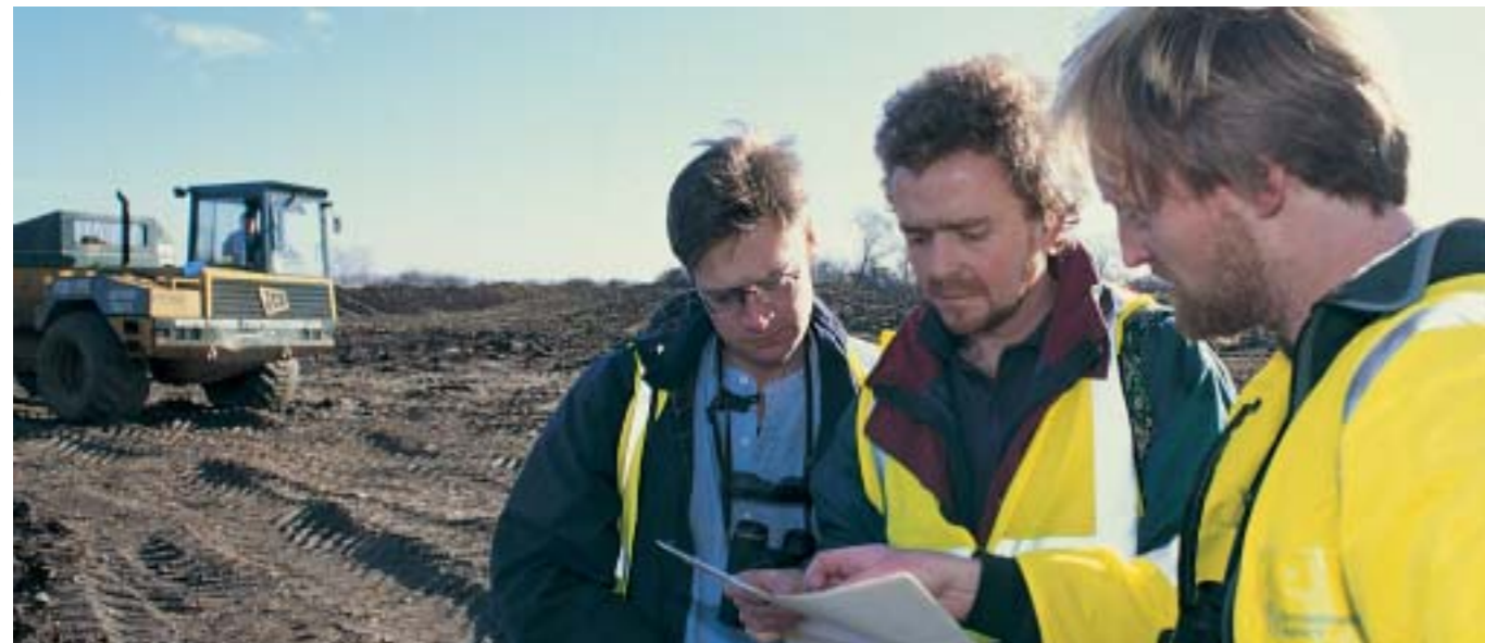
Much of our work at wetland reserves involves creating shallow lagoons and manipulating water levels for the benefit of both breeding and wintering birds.

Stone-curlews bred after a gap of 40 years at Minsmere, in Suffolk, where arable fields are being returned to heath.