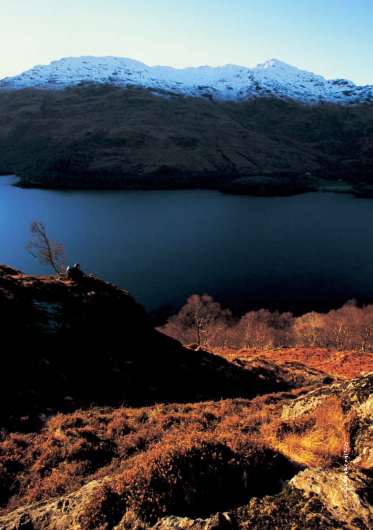
Andy Hay (rspb-images.com)

In 2004, the RSPB celebrated 100 years of working for Scotland's wildlife. Celebrations, from local events to a reception in Edinburgh Castle, marked our achievements and our long-term commitment to working with the people of Scotland for birds and other wildlife. The last century has seen our presence in Scotland grow, with more than 140 staff and more than 70 nature reserves from Shetland to the Solway under our management. We have enjoyed many conservation successes but the threats and challenges to our wildlife are ever present. Current work includes action to help capercaillie, corncrakes and farmland birds as well as improving and creating habitats from the peatlands of Caithness, to the wet grasslands of Dumfries.