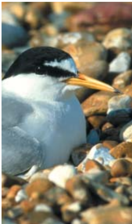
Little terns did well in North Wales and live pictures of the colony were beamed to television screens at nearby visitor centres. Cafodd y fôr-wennol fechan flwyddyn dda yng Ngogledd Cymru a darlledwyd lluniau byw o'r nythfa i sgriniau teledu mewn canolfannau ymwelwyr gerllaw.