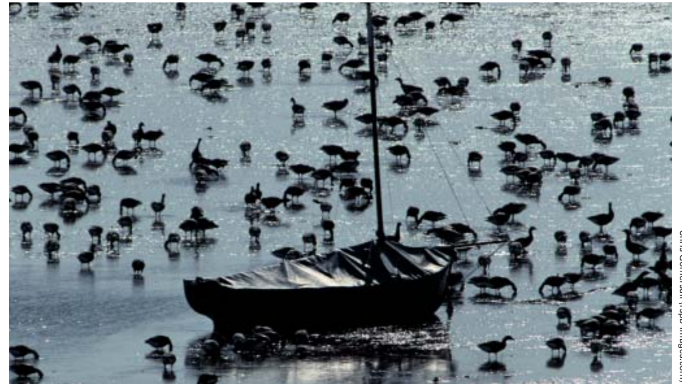
Several port development proposals threatened estuarine habitats used by large numbers of wildfowl, such as brent geese (above), and wading birds.

The rejection of the Dibden Bay port development proposal was important in its own right and should inform other cases that involve development threats to supposedly protected areas.