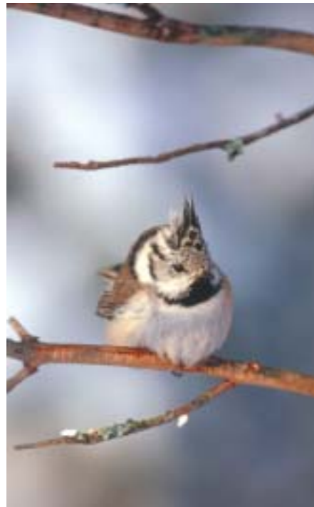
Crested tits are widespread in Europe, but in the UK they are scarce birds, restricted to pinewoods in northern Scotland.