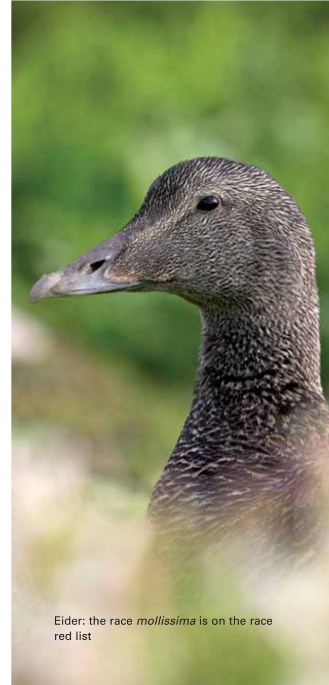
Eider: the race mollissima is on the race red list