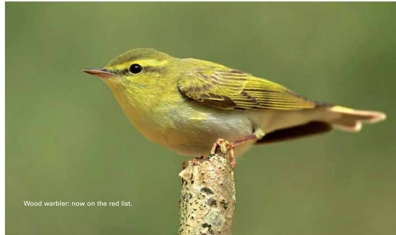
Wood warbler: now on the red list.

The assessment at race level highlights the conservation and biodiversity significance of the UK's endemic and near-endemic races. It also allows us to target conservation prioritisation more precisely; for example, the wintering islandica race of black-tailed godwit is flourishing and green listed: the limosa race (which breeds in England) is declining and red-listed. Although most bird conservation work in the UK is targeted at species, this new approach may prove a valuable tool.