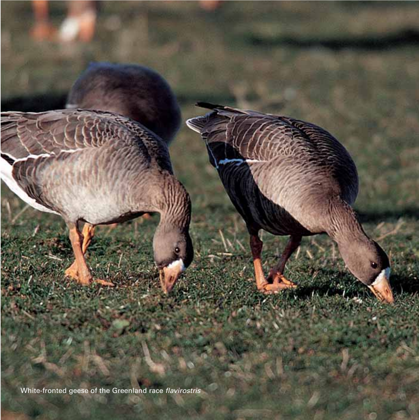
White-fronted geese of the Greenland race flavirostris