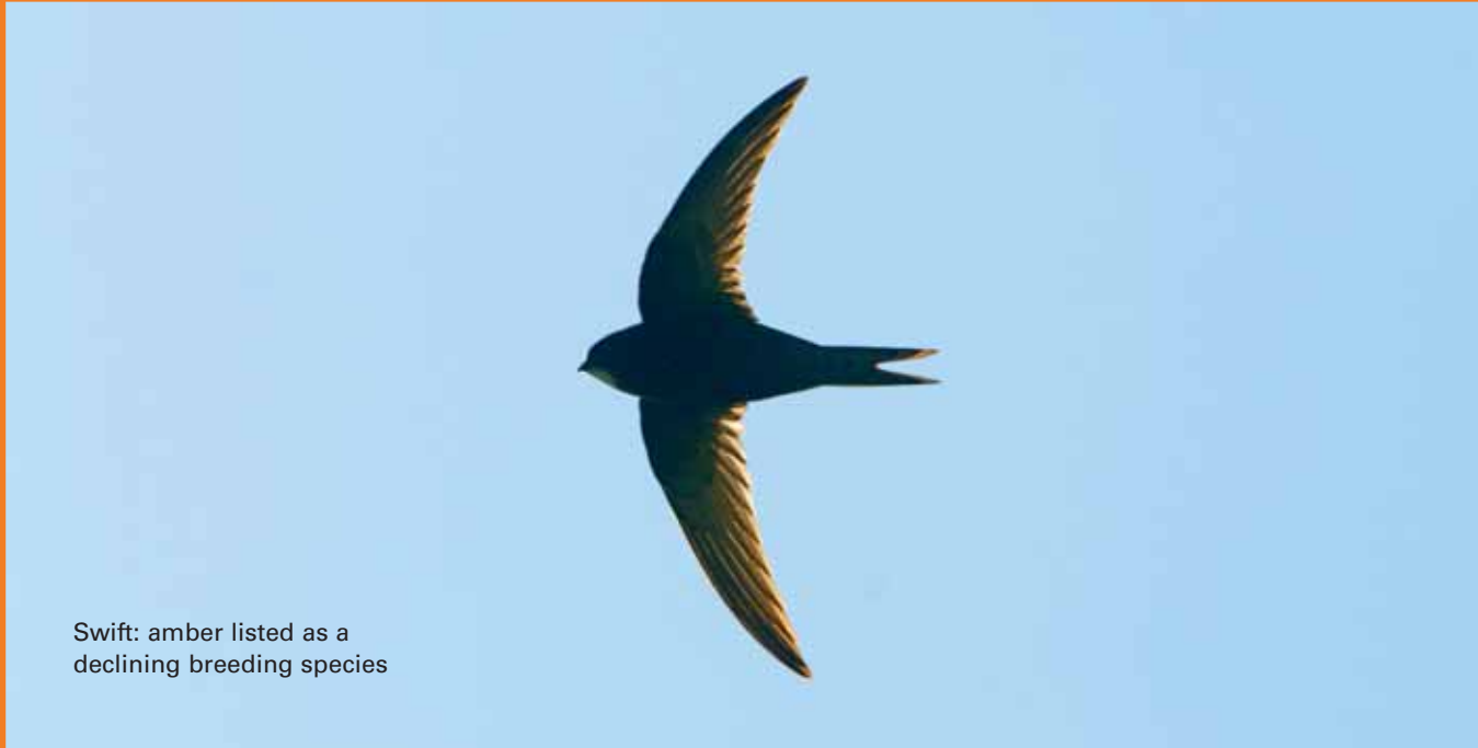
Swift: amber listed as a declining breeding species