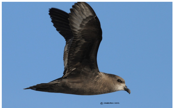
Murphy's Petrel above Henderson Island. Over 25,000 petrel chicks are killed by rats on Henderson every year. (Peter Harrison)

The rats will be removed by highly experienced eradication experts, who will use two GPS-guided helicopters to methodically drop poison bait across the island. It will take approximately two days for the entire island to be treated, with the whole operation being repeated one week later so as to ensure that no rats survive. Bird populations are expected to boom once rats are removed, with Henderson petrel numbers projected to increase from