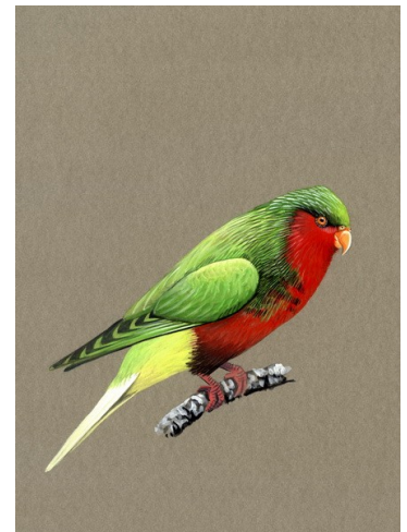
The endemic Henderson Lorikeet