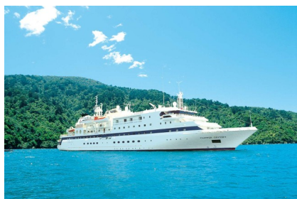
The Clipper Odyssey — two luxury cabins for two are to be won.