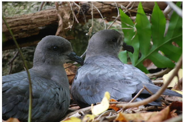
Murphy's petrels on Henderson Island. Over 25,000 petrel chicks are killed by rats on Henderson every year.

For several years, the RSPB has been working with other partners to develop plans for the restoration of Henderson Island. Following completion of a feasibility study in 2008, an OTEP-funded research expedition visited Henderson in September 2009 to resolve outstanding technical issues. The expedition team concluded that an eradication project is technically feasible, giving the green light to