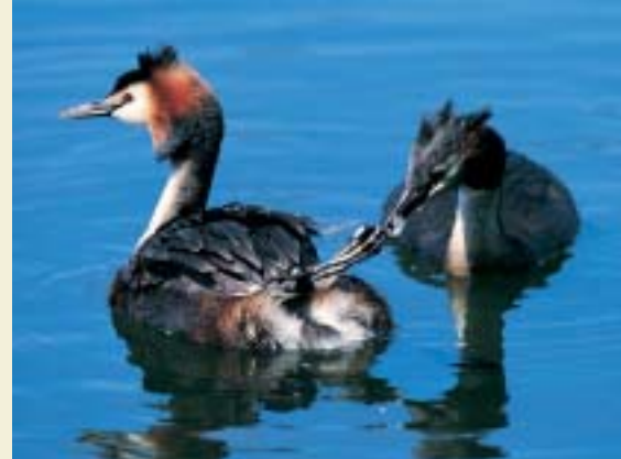
Great crested grebe and chick