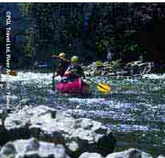
River Ardèche, France

Education and Skills Select Committee 2005