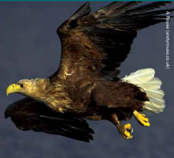
A Rouse (andy.rouse.co.uk)

We stepped up our research to understand what is happening. Climate change probably plays a part. Shortages of sandeels are significant; we welcomed the continued closure of the North Sea fishery. Given the importance of Scotland's seabirds – some 45% of Europe's seabirds breed here – this will continue as a major focus of our work.