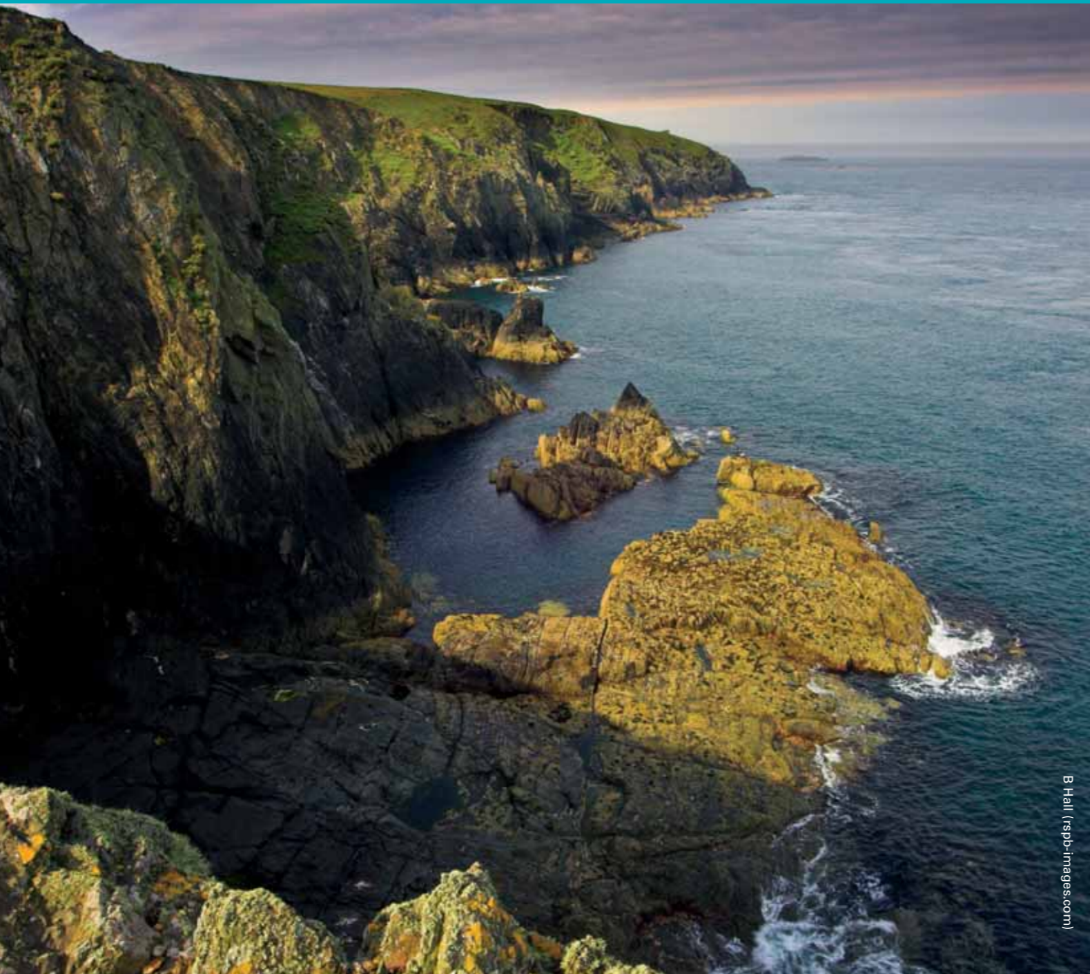
B Hall (rspb-images.com)

We manage more than 190 nature reserves. Saving and improving the best wildlife sites as nature reserves is more important than ever in the face of intense pressures on the countryside. New nature reserves and extensions, costing £7 million, added 2,023 hectares to our reserves. This made up for fewer land acquisition opportunities in recent years.