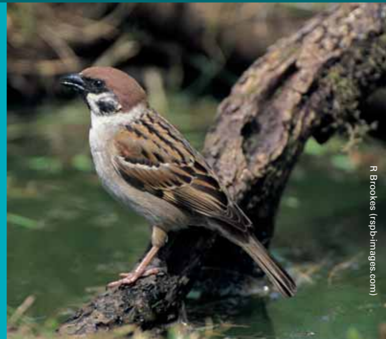
R Brookes (rspb-images.com)

While some wild species are increasing, others are in decline. Turning downward trends around depends on understanding the reasons behind them. RSPB research aims to identify problems and steer practical action.