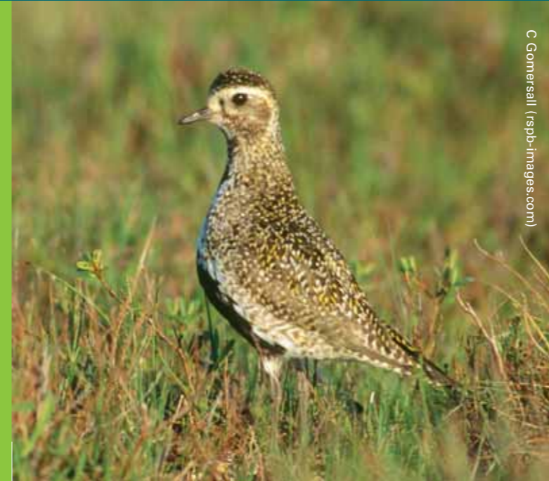
C Gomersall (rspb-images.com)

We work, with considerable success, to ensure that sites rich in wildlife are not destroyed by development. We negotiate so that damage is avoided, whenever possible. We oppose destructive proposals robustly, where necessary.