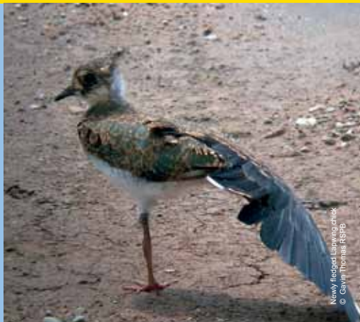
Newly fledged Lapwing chick

The United Utilities estate is undoubtedly the single most important breeding site in England for hen harriers, averaging 71% of successful nesting attempts in England over the last 5 years.