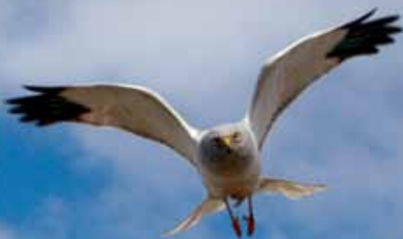
Male Hen Harrier

collective effort of the AONB team, partner organisations such as the RSPB, community groups and most of all the tourism businesses themselves who have worked hard over the last five years to deliver tourism with sustainability at the core.