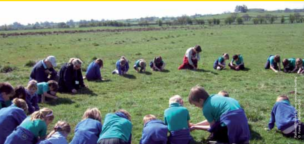
Retamal Primary School, Ribbles Valley

Then in May, each school visited a local farm to see how Bowland's farmers and their livestock are helping to conserve the area's nationally important populations of wading birds. Kids delighted in seeing their first ever real live lapwing chicks not to mention seeing lambs being born, calves, kids, ponies and plenty of other cute creatures that will no doubt now be on many Christmas lists! Apologies parents!