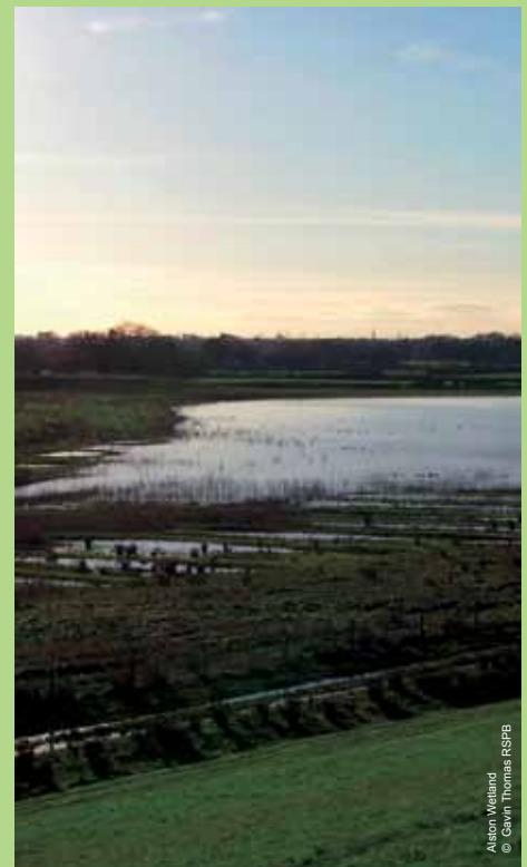
Alston Wetland

The primary objective at Alston Wetland is to manage it for breeding wading birds. Since the reservoir was drained, the site has held breeding little-ringed plover, redshank, snipe, common sandpiper and oystercatcher. The site is particularly important for breeding lapwing - there were a minimum of 22 nests this spring and the majority of these breeding attempts resulted in fledged chicks. The site is not only attracting the birds; great-crested newt, brown hare and roe deer can also be found here and the diverse grassland supports a wide variety of insect life including a number of butterfly, moth, dragonfly and damselfly species.