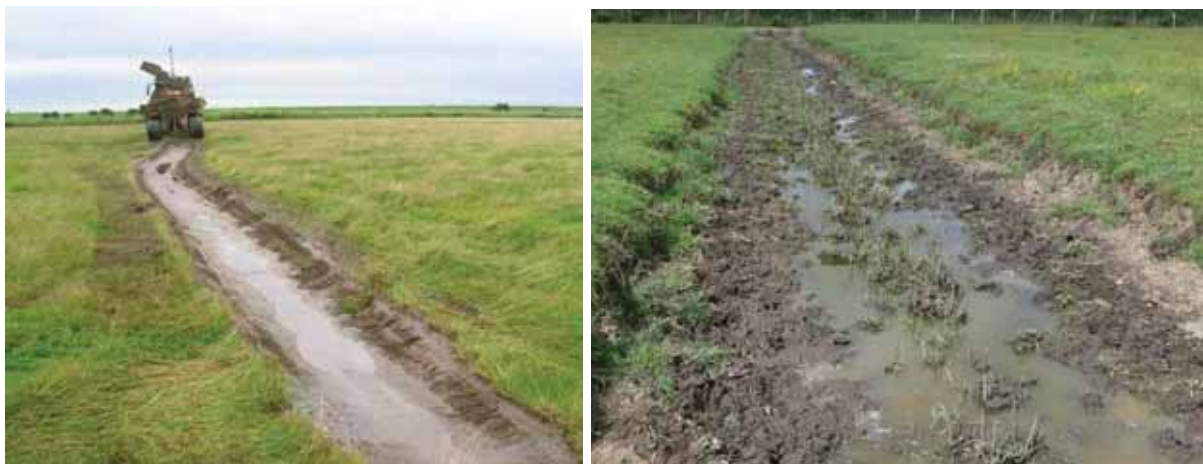
Rotary ditcher making its first pass in September 2009 & existing ditch in July 2010, holding water despite the dry summer