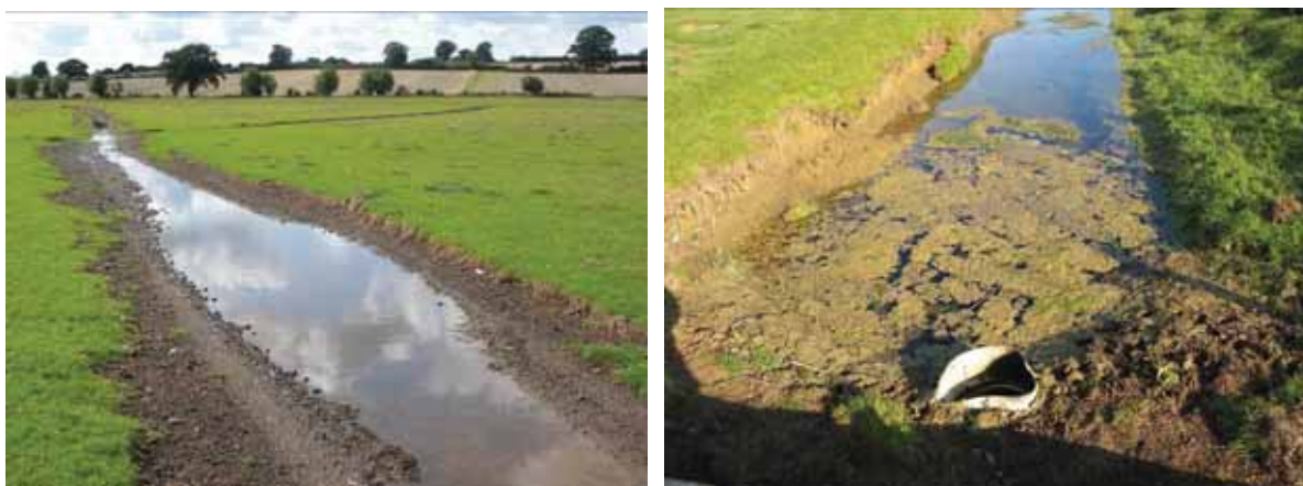
Freshly cleaned foot drain after heavy rainfall and right-angle bend sluice

To further enhance the site there is a stocking restriction until July at 0.75 LU/ha. Three right-angle bend sluices have been installed and a number of willows have been entered into a pollarding regime to keep an open aspect.