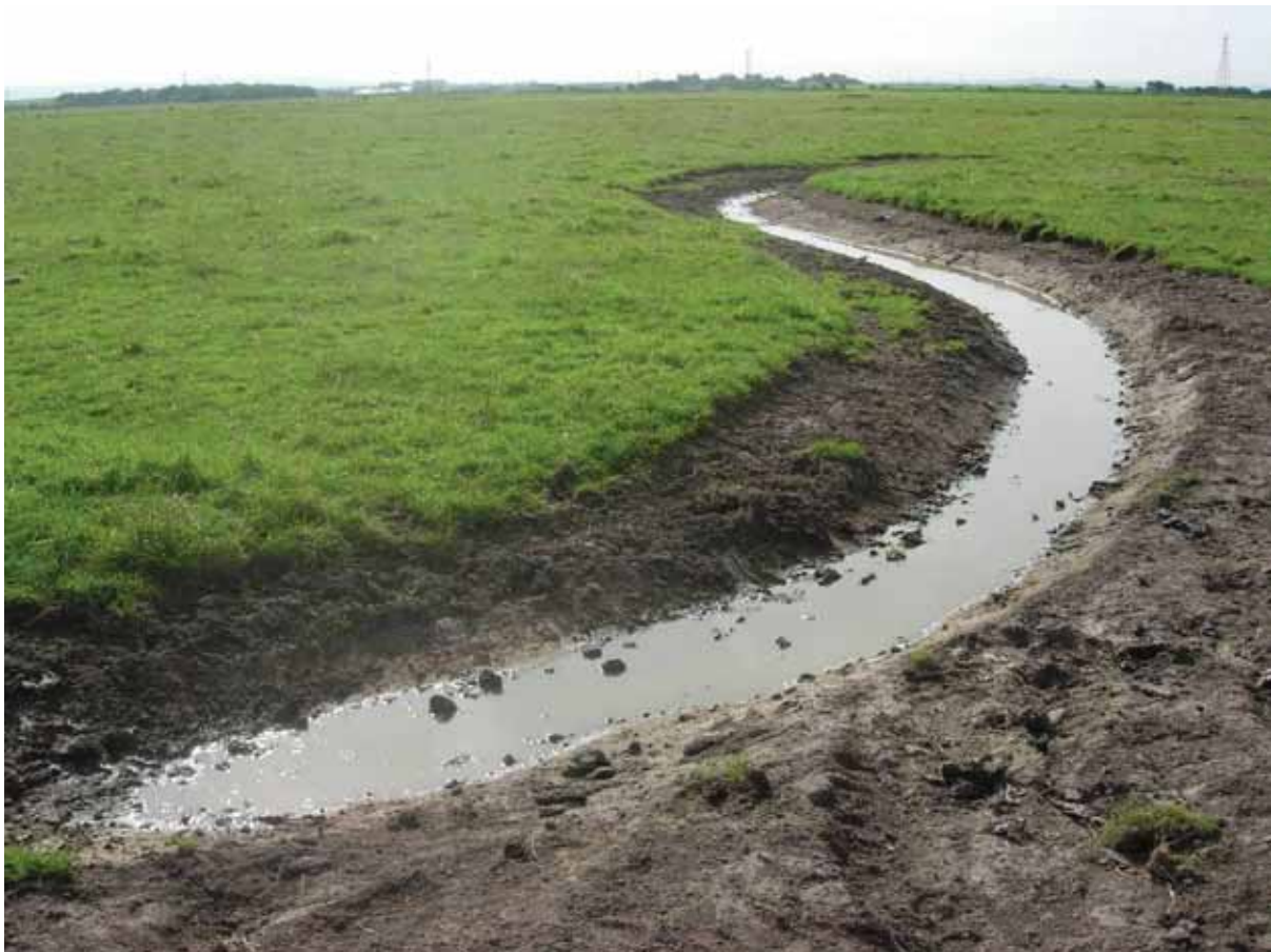
Newly created channel following rain a few weeks after the work

The Freckleton and Newton Marsh Owners Association for agreeing to enter HLS and for wishing to see the ditcher used on their site. Lancashire FWAG for submitting the HLS application and assistance with scheme design. Natural England and Environment Agency for approving and processing the application, and for advice regarding consents.