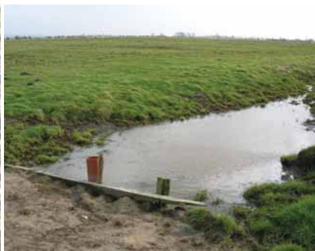
John Gerrard inspecting a sub-surface pipe sluices (left) and soil bund and pipe sluice backing water up one of the existing ditches