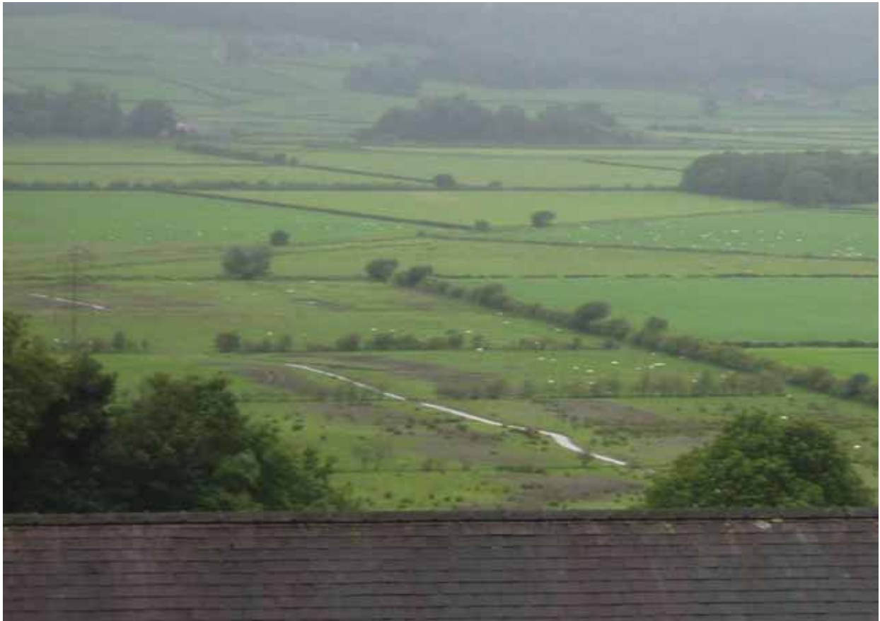
The channel created by the rotary ditcher

The created/restored channels are formed from clay and quickly fill up with rain water. They can be seen from the road above the valley. The site is monitored 6 times a year by the Cumbria bird Club.