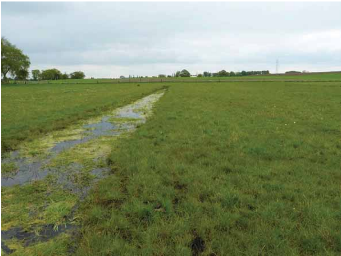
Shallow foot drain created by the rotary ditcher

A series of nine linear foot drains were dug using the rotary ditcher, these were 30-40 cm deep, and 2-3 metres wide. Most of these are blind features, however they follow the route of sub-surface drains which have been blocked with control sluices. In total, 636 metres of shallow foot drains have been created.