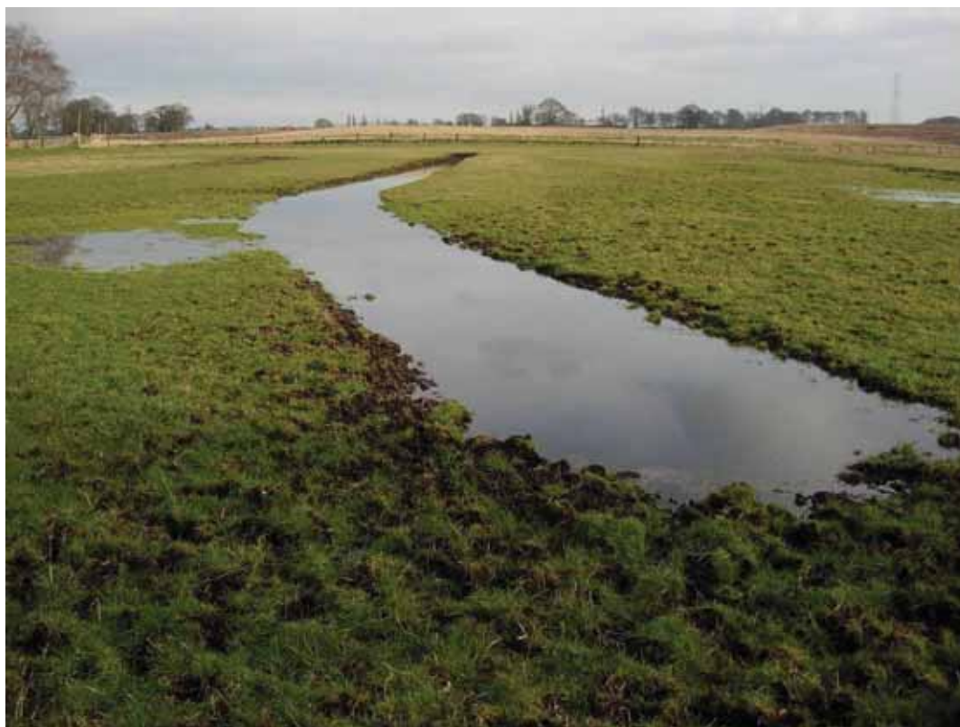
Foot drain with surface flashing

Lapwings in 2009 numbered 2 pairs, with an additional 1-3 pairs on adjacent arable. In 2010, at least 5 pairs were thought to be present. Productivity appears to be good. The ditches have held water well, even in drier conditions.