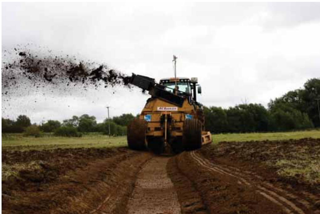
Creating a foot drain at Chimney Meadows Nature Reserve