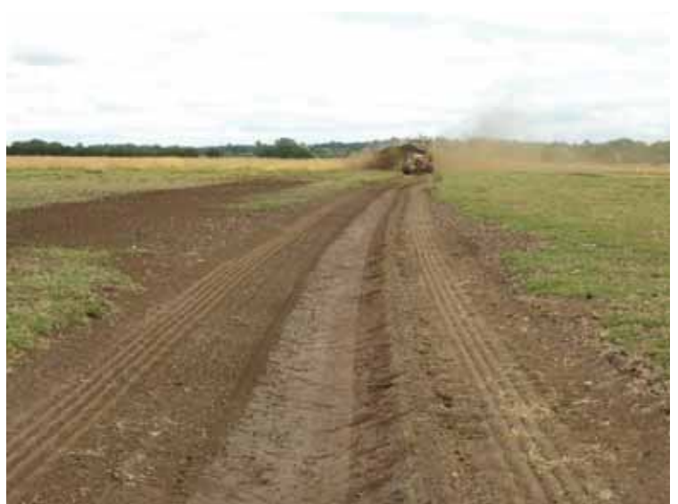
Newly excavated foot drain

We were always mindful of leaving space for vehicles and topping operations. Foot drains were made shallow in some sections to allow vehicles to drive across them.