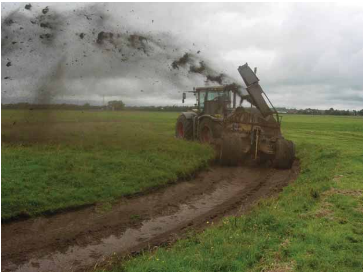
The rotary ditcher opening out a former saltmarsh creek

The rotary ditcher worked for three days in August 2010.