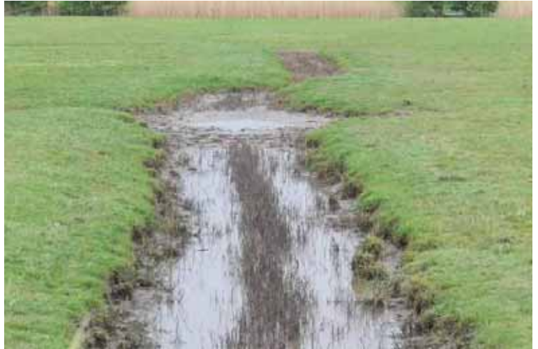
Existing muddy ditch in May 2010. A pair of adult Lapwings are watching over their chicks, one of which is just about visible feeding in the small pool at the far end of this ditch

Soil bunds with pipe sluices had previously been installed, with land drains interrupted with sub-surface pipe sluices. These help to maintain high ditch water levels and a high water table into the early summer and are sufficient to create localised re-wetting of the grassland.