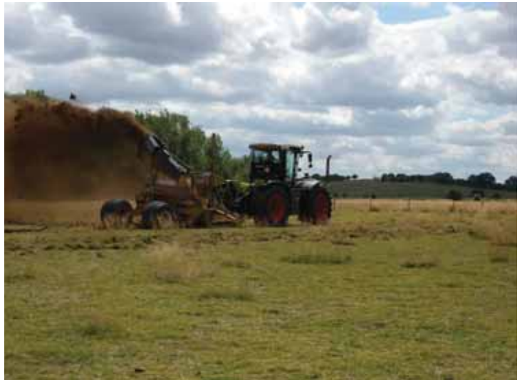
Rotary ditcher at Home Farm

30 hectares of riverside meadows grazed by ewes and lambs. The soils are alluvial over a layer of shallow Oxford clay. The fields are entered into Higher Level Stewardship as restoration of wet grassland for breeding waders.