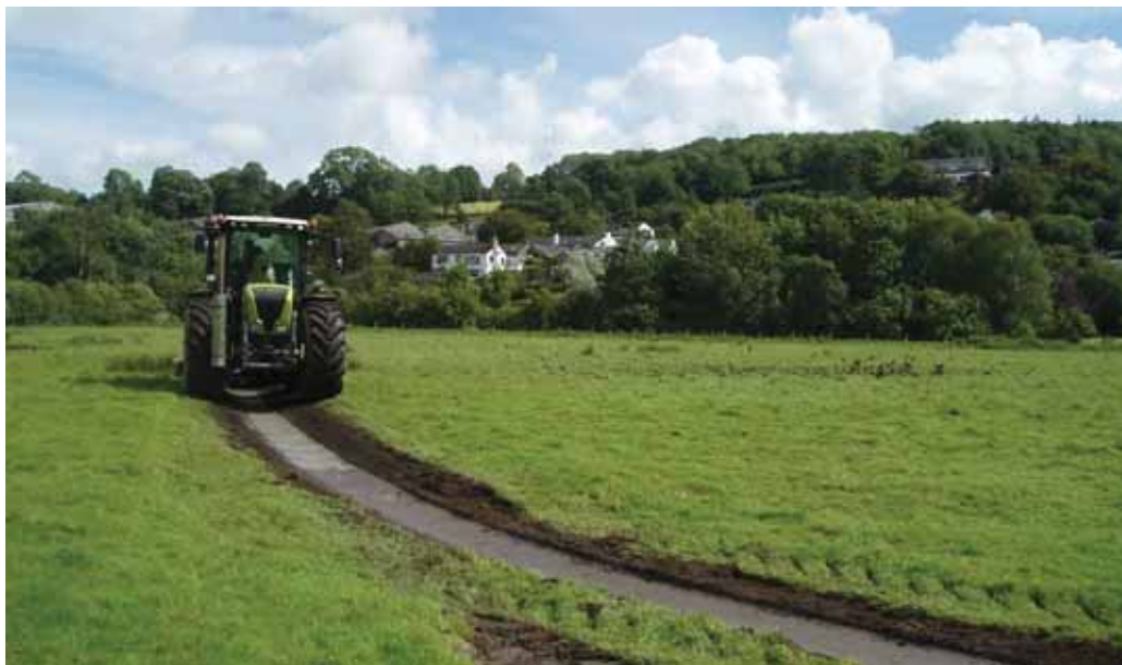
The rotary ditcher on the second pass

Old creek channels were followed as far as possible, and some lateral sections of ditch were created. Depth varied from 5-10 cm close to the Levens main drain to approximately 50 cm near the Catchwater, with a width of 3 metres. An 8 metre length was left at both ends of the main ditch due to land drainage consent requirements, earth bunds with right angled pipe sluices will be installed here at a later date. 1181m length of shallow channel was created.