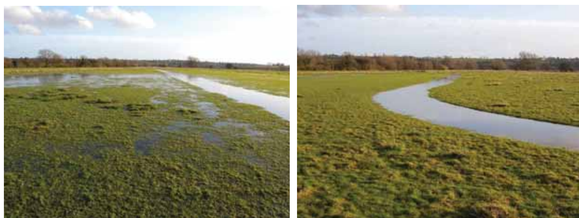
Foot drains and surface flashing late winter 2010

Within one year of the initial work redshank and lapwing were breeding on the site. Curlew which breed in adjacent hay meadows are also seen regularly feeding on the site.