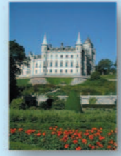
3 Dunrobin Castle