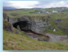
Smoo Cave, Durness