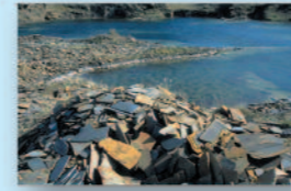
31 Achanarras World famous fossil site