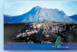
Castle Varrich and Ben Loyal, Tongue