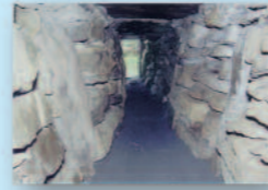
11 Camster Cairns 5000 year old burial site