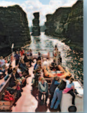
20 John O'Groats Ferries Wildlife Cruises