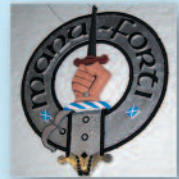
30 History of Clan Mackay, Strathnaver Museum