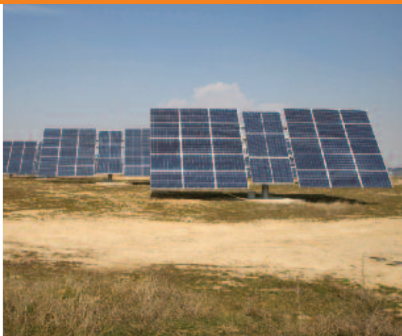
When poorly sited, large solar arrays can cause habitat loss for various species.