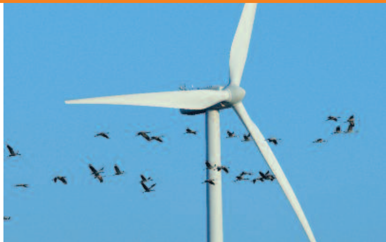
Collision with wind turbine blades is a risk for certain bird species.