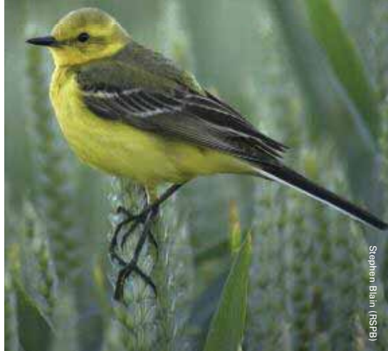
Stephen Blair (RSPB)

Population declines in many long-distance migrants, such as yellow wagtails, remain apparent