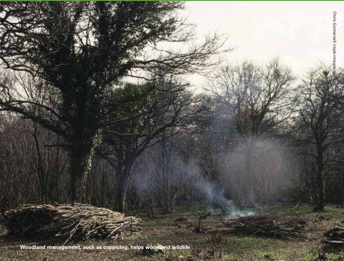
Woodland management, such as coppicing, helps woodland wildlife