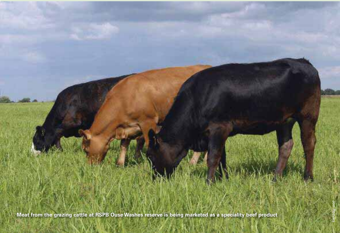
Meat from the grazing cattle at RSPB Ouse Washes reserve is being marketed as a speciality beef product

It is essential that this management is targeted at grassland with high ryegrass content. Unlike most other