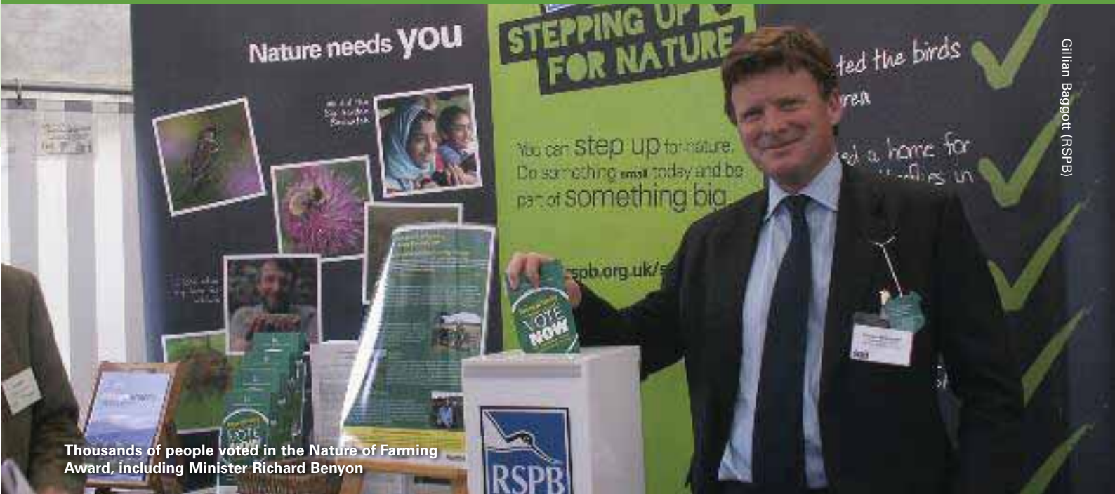
Thousands of people voted in the Nature of Farming Award, including Minister Richard Benyon