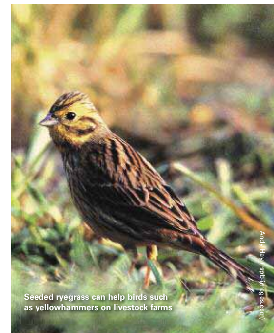
Seeded ryegrass can help birds such as yellowhammers on livestock farms