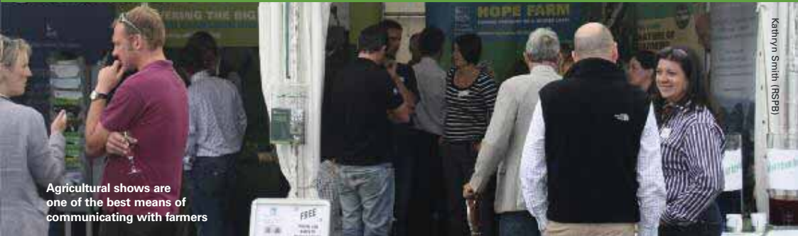
Agricultural shows are one of the best means of communicating with farmers