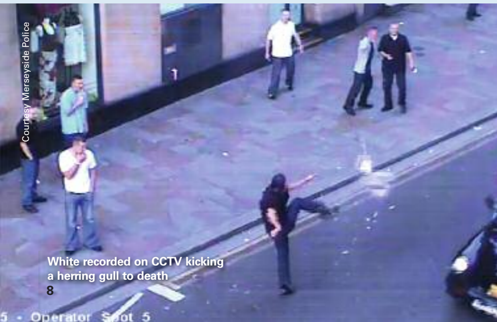
White recorded on CCTV kicking a herring gull to death

I attended the hearing to assist the Crown Prosecution Service (CPS) and ensured the court were able to view the CCTV footage that had been recorded.”