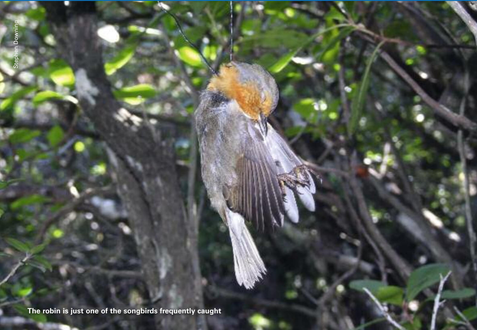
The robin is just one of the songbirds frequently caught