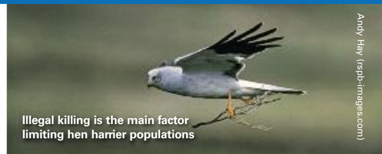
Illegal killing is the main factor limiting hen harrier populations