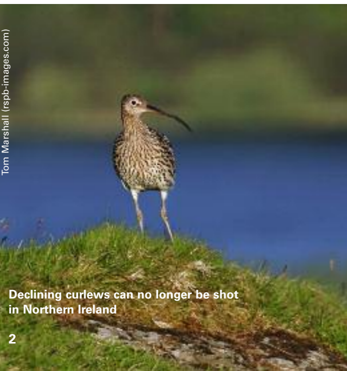
Declining curlews can no longer be shot in Northern Ireland

SSPCA has asked us to pass on their thanks to: the Procurator Fiscal Service, OneKind, RSPB, Science and Advice for Scottish Agriculture and the National Wildlife Crime Unit.