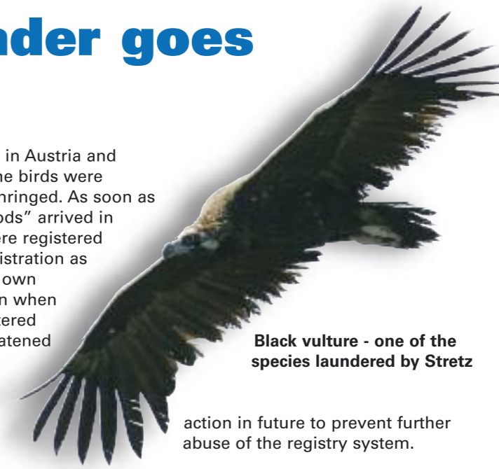
Black vulture - one of the species laundered by Stretz

The German Federal Agency for Nature Conservation has asked officials to pay attention to birds with documents from Pirmasens during controls and to initiate their own