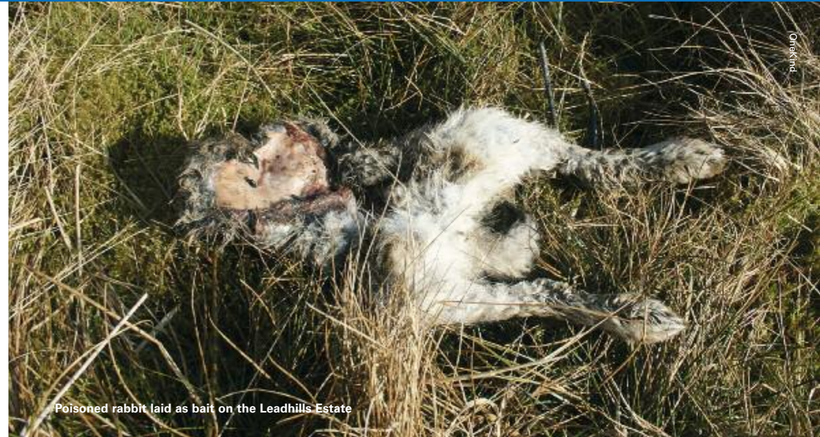
Poisoned rabbit laid as bait on the Leadhills Estate

The bill has gone forward for Royal Assent. For further details see www.northernireland.gov.uk/index/media-centre/news-departments/news-doe/news-doe-010311-minister-welcomes-new.htm