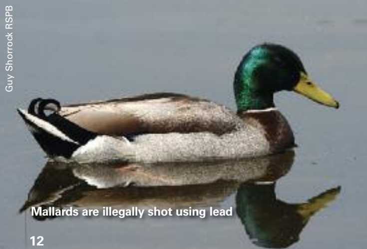
Mallards are illegally shot using lead

See www.leadammunitiongroup.co.uk for information.