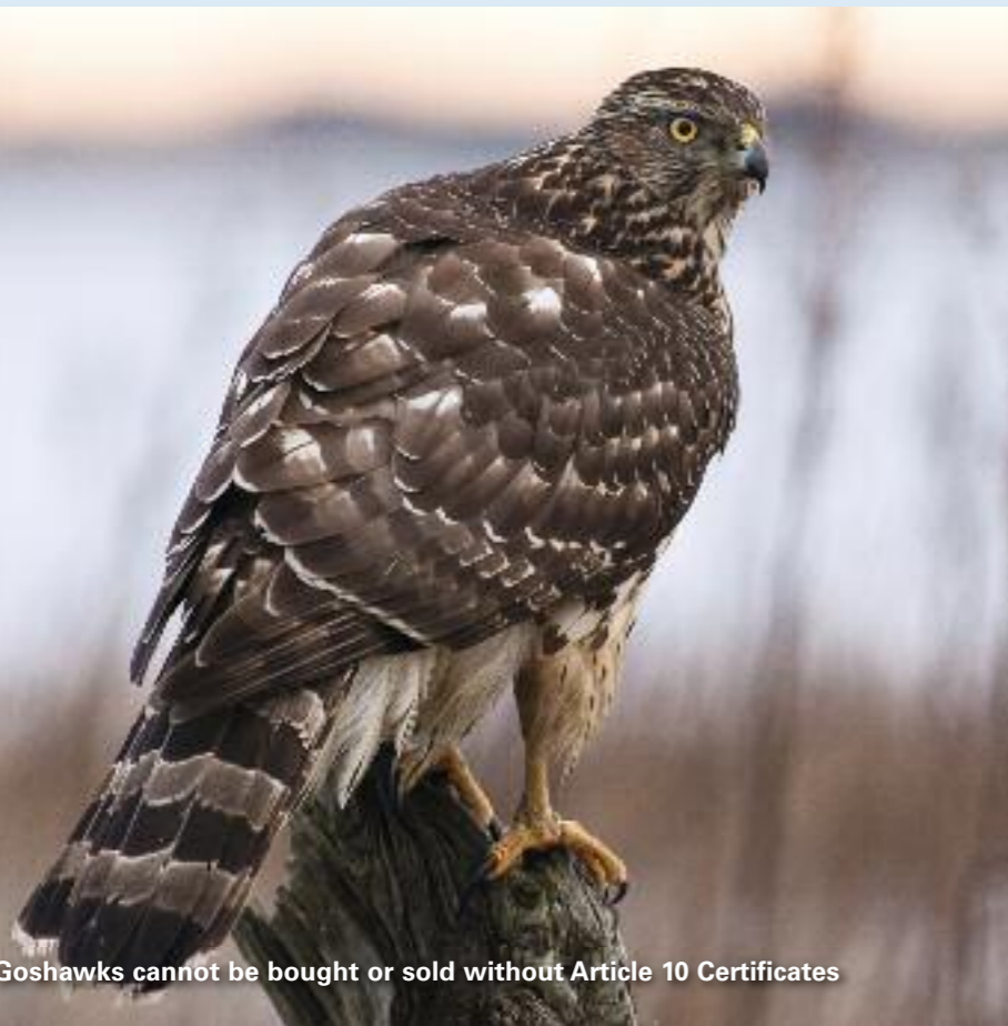
Goshawks cannot be bought or sold without Article 10 Certificates