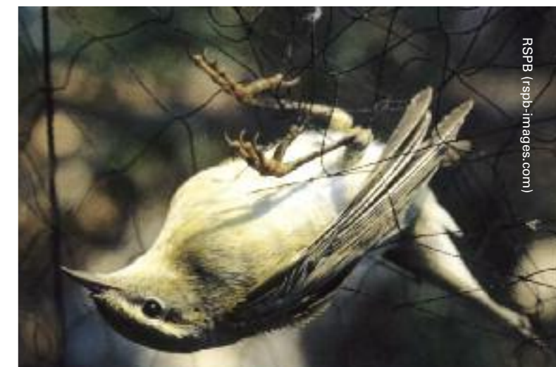
Willow warbler caught in a net in Cyprus

Although trapping levels are thought to be lower than those experienced in the 1990s, the situation must be addressed urgently. Trappers are reportedly making hundreds of thousands of Euros by selling songbirds to restaurants to be served up as expensive delicacies.