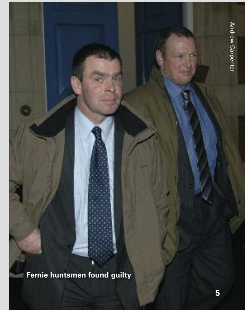
Fernie huntsmen found guilty

The two men have since lodged an appeal against their convictions.”