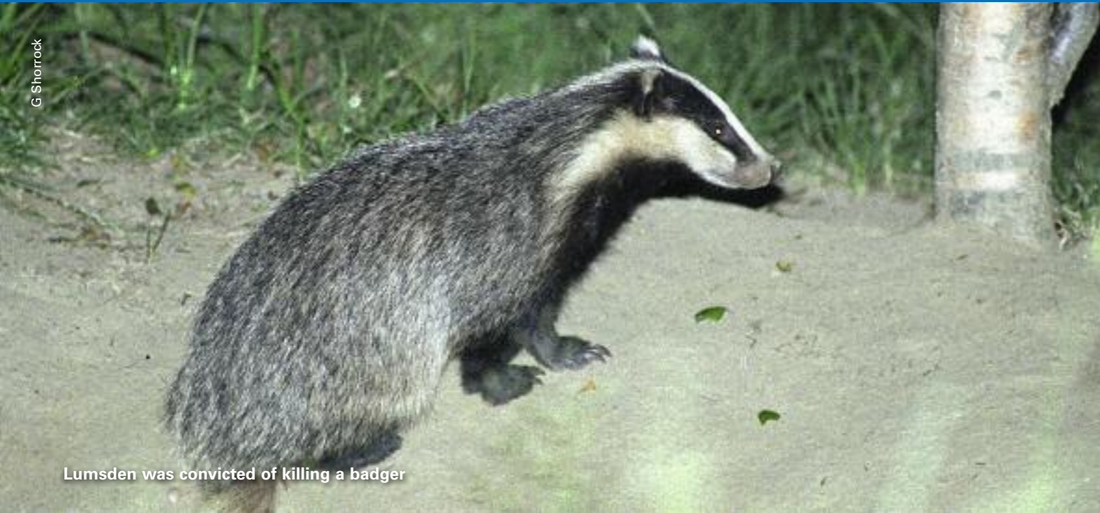
Lumsden was convicted of killing a badger