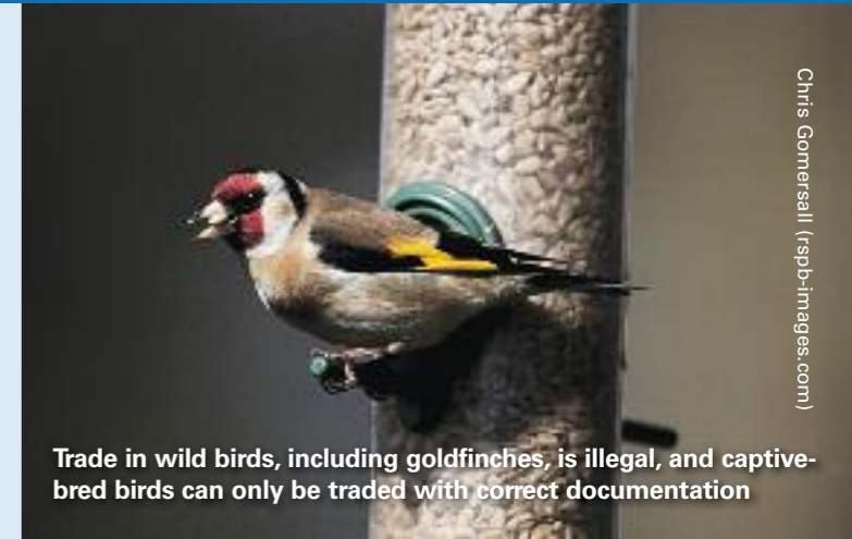
Trade in wild birds, including goldfinches, is illegal, and captive-bred birds can only be traded with correct documentation