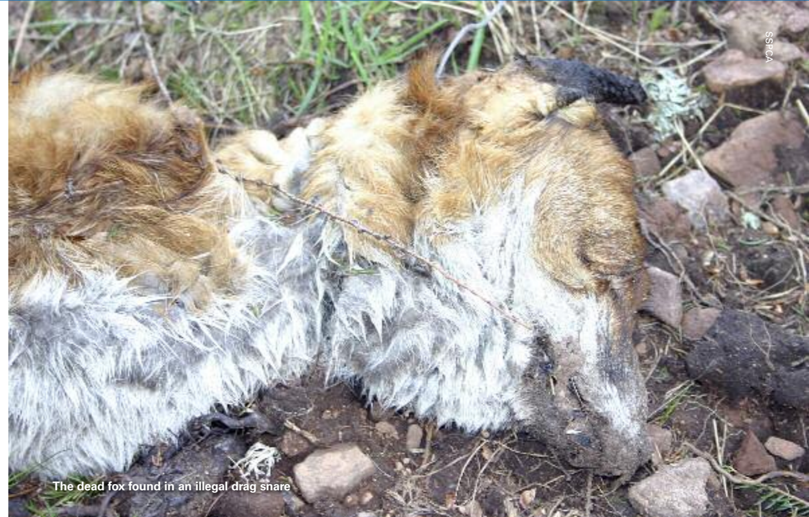
The dead fox found in an illegal drag snare