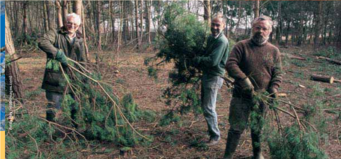
Andy Day (rspb-images.com)