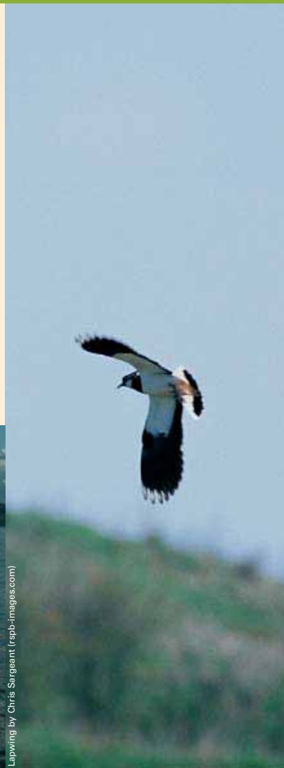
Lapwing