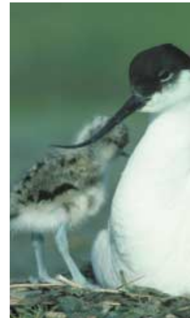
CH Gomersall (RSPB Images)

www.rspb.org.uk/wildlifeconservation/climatechange