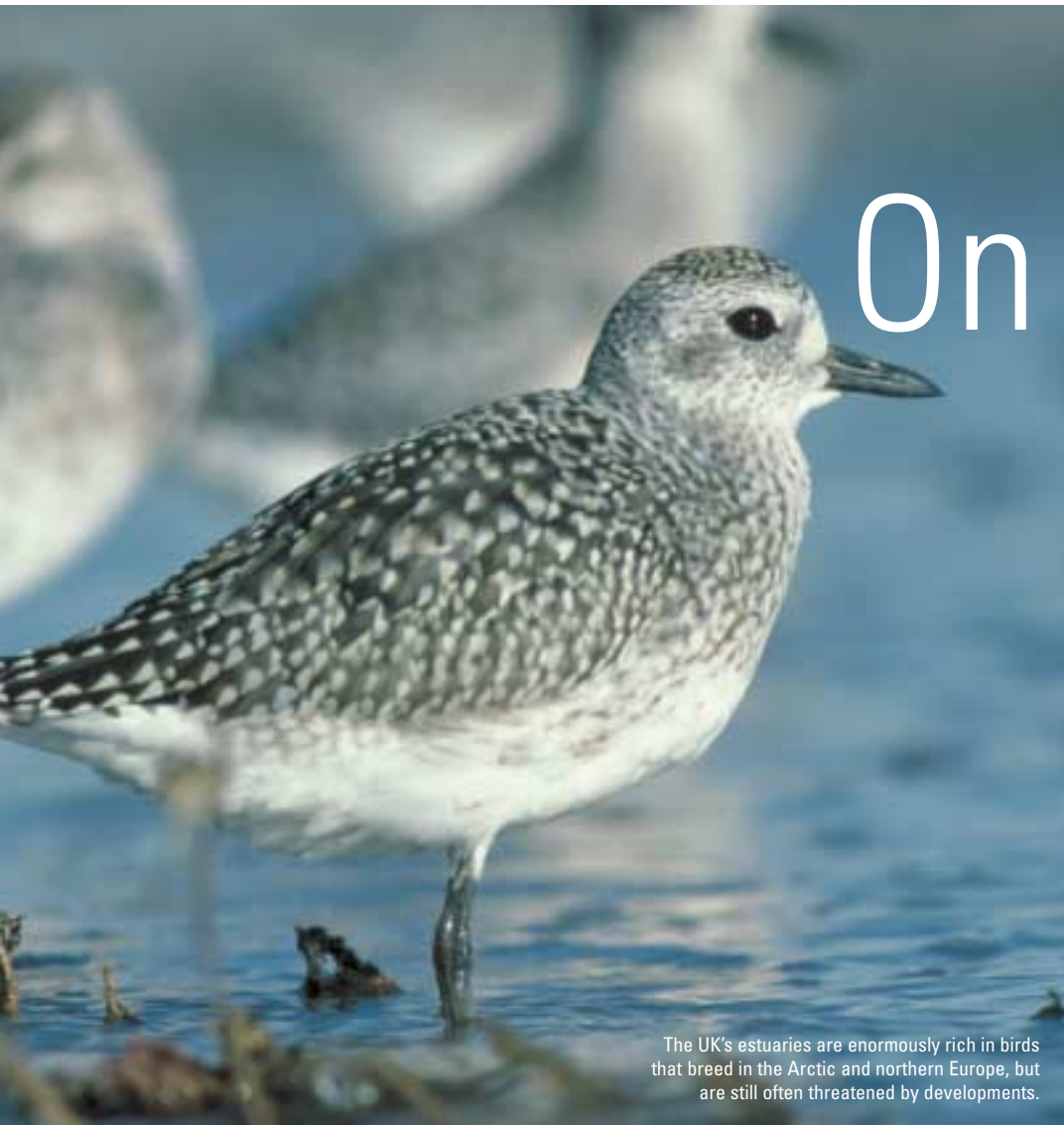
Grey plover

The UK's estuaries are enormously rich in birds that breed in the Arctic and northern Europe, but are still often threatened by developments.