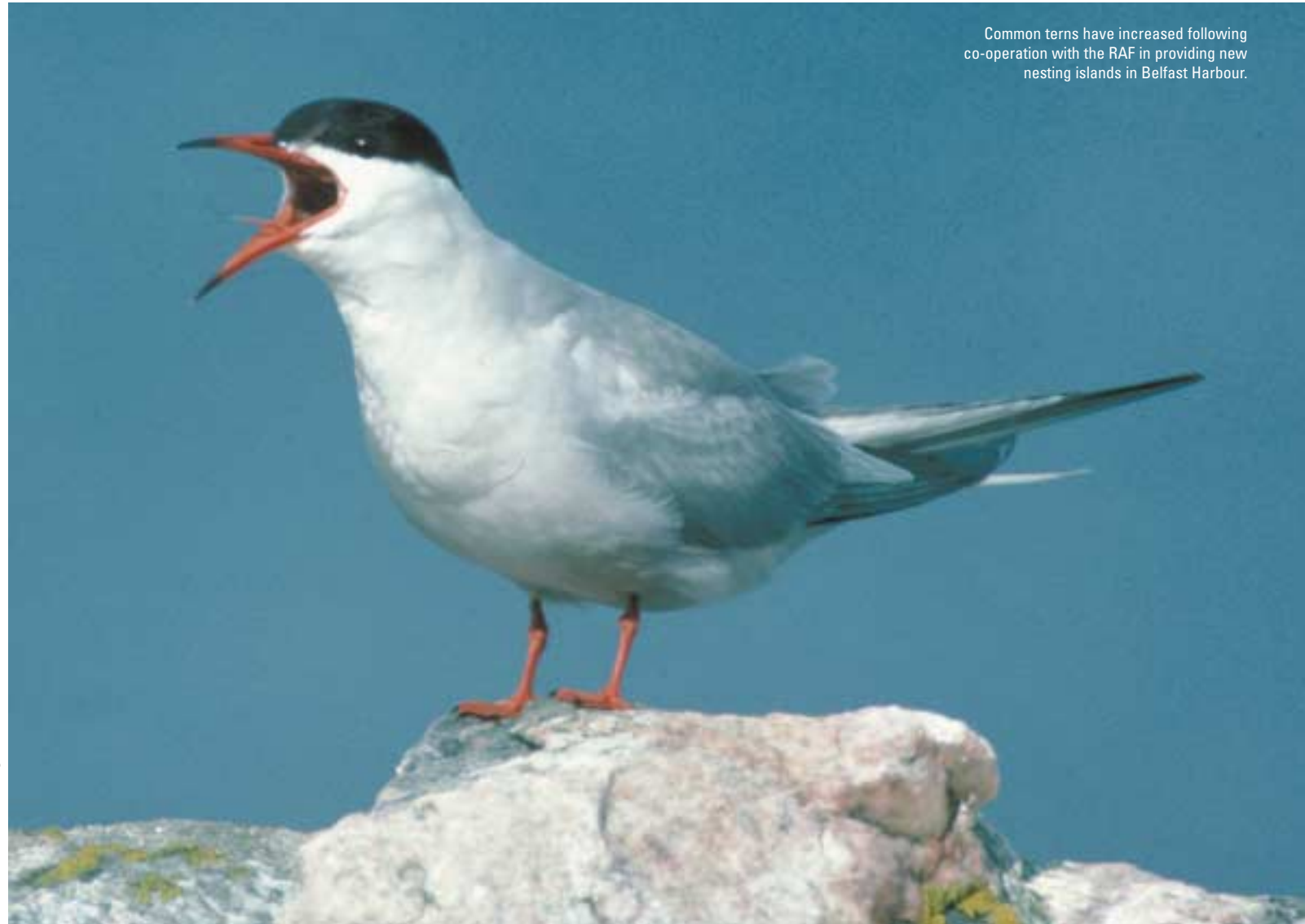
Steve Kneil (RSPB Images)

Common terns have increased following co-operation with the RAF in providing new nesting islands in Belfast Harbour.