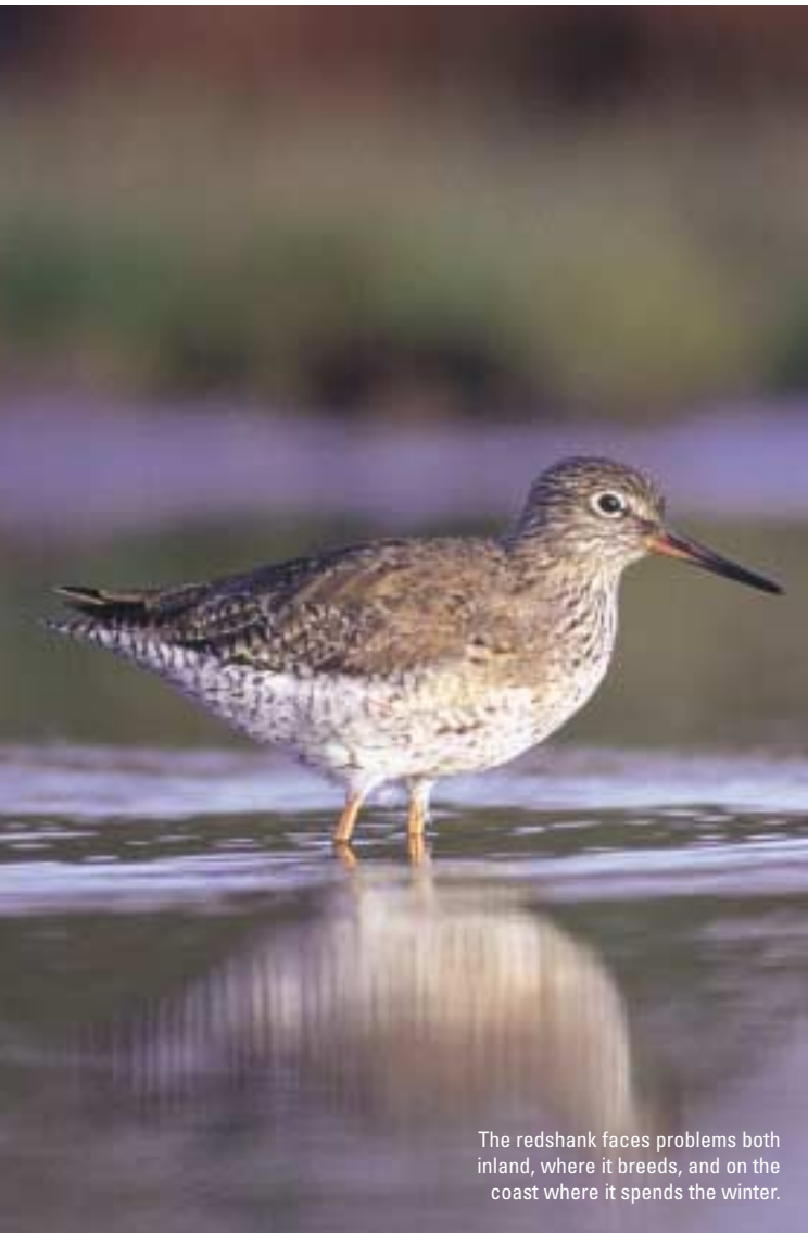
The redshank faces problems both inland, where it breeds, and on the coast where it spends the winter.