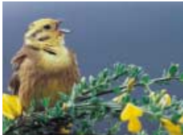
Philip Newman (RSPB Images)

In Northern Ireland the yellowhammer is becoming an emblematic bird for the wrong reasons: it is fast disappearing.