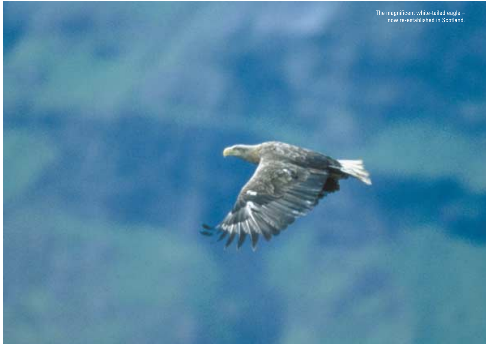
The magnificent white-tailed eagle – now re-established in Scotland.