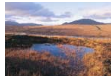
Niall Benzie (RSPB Images)

Hand in hand with restoring the fortunes of 'biodiversity hotspots' we must find a brighter future for the farmed landscape and the birds that depend on it, from the curlew to the skylark. In the wake of last year's devastating foot and mouth outbreak, a lot of farming remains under enormous stress, but there is growing accord on key elements of the way forward. We lobbied hard for the recommendations of Sir Don Curry's Commission on the Future of Farming and Food to be implemented. Of central importance is the early introduction of a new broad agri-environment scheme, so that farmers can be properly rewarded for stewardship of the natural environment. We also value