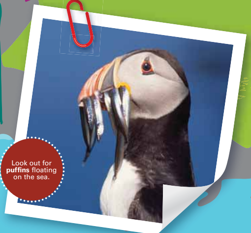
Look out for puffins floating on the sea.