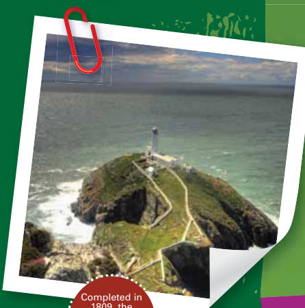
Completed in 1809, the lighthouse still warns ships of the treacherous rocks.

Try this 1.5 mile trail if you have a head for heights. It follows the same route as the Ellins Tower trail to the tower, but then heads along the winding cliff path where you might see swaths of wild flowers and the dazzling acrobatics of choughs and ravens. On your way back to the visitor centre, you might even spot a basking adder.