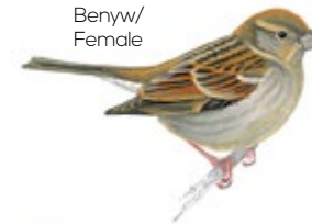
Aderyn y to/ House sparrow