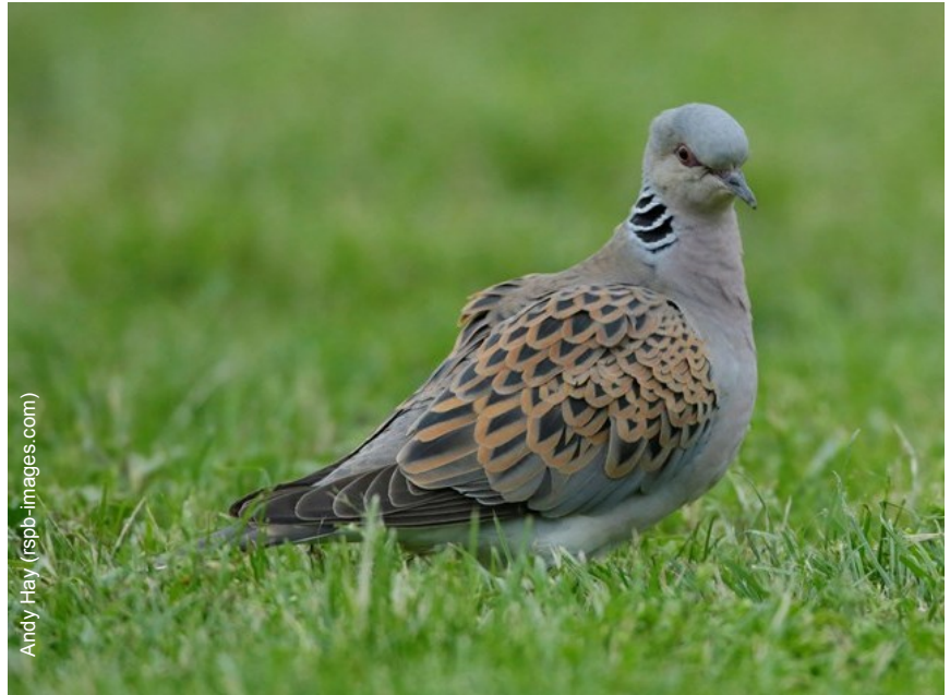
Andy Hay (rspb-images.com)

The turtle dove nests in mature hedgerows, tall scrub and woodland edges, often close to freshwater. They feed in weedy arable fields. Within the UK it is now largely confined to Eastern England, especially the south-east and East Anglia. The UK population of turtle doves fell by 95% between 1967 and 2012. One reason for this decline is lack of seed food on farmland in the summer. The turtle dove is a summer visitor to the UK, arriving in late April and leaving in September, and problems on the migration route and in the African wintering grounds may be exacerbating the decline of the population.