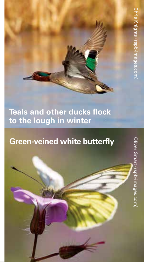
Teals and other ducks flock to the lough in winter

In winter, the lough comes alive with ducks and geese escaping the harsh weather further north.