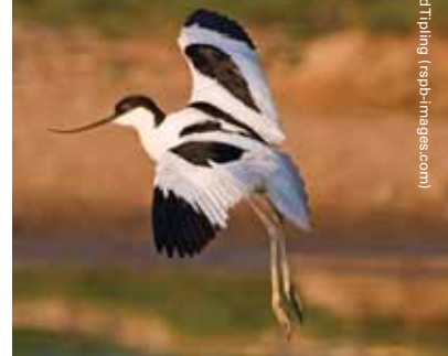
See the elegant avocets.