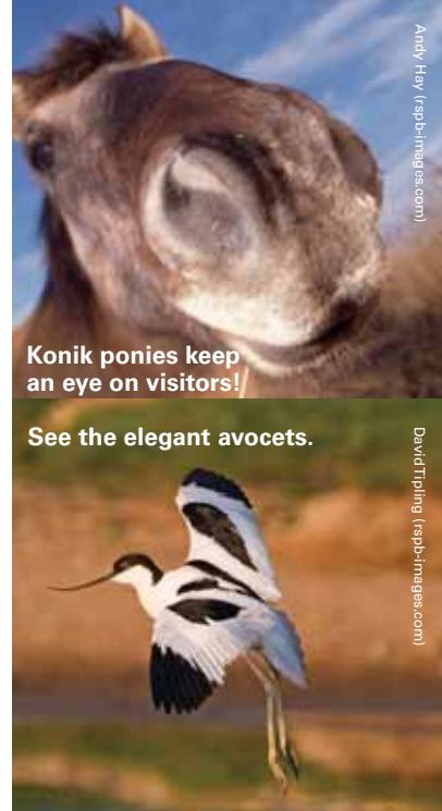
Konik ponies keep an eye on visitors!

This path is a great place to looking out for hares running around. At the end of the path the Ousefleet hide gives you views that overlook the grazing marsh. Here you can find whistling ducks, such as teals and wigeons in winter. Next to this hide is a viewing screen that is always worth a look as you never know what may be hiding beyond it.