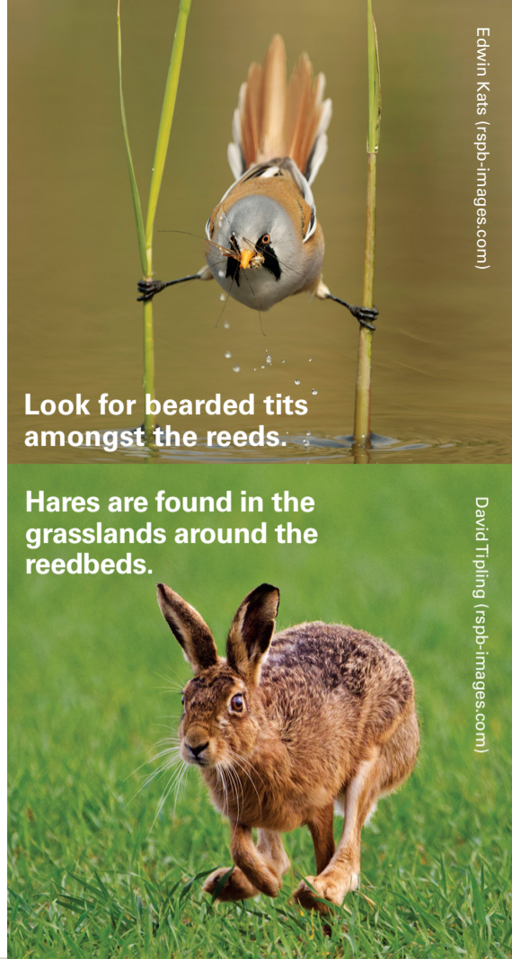
Look for bearded tits amongst the reeds.

Otters and water voles are present in the reedbeds but are rarely seen.