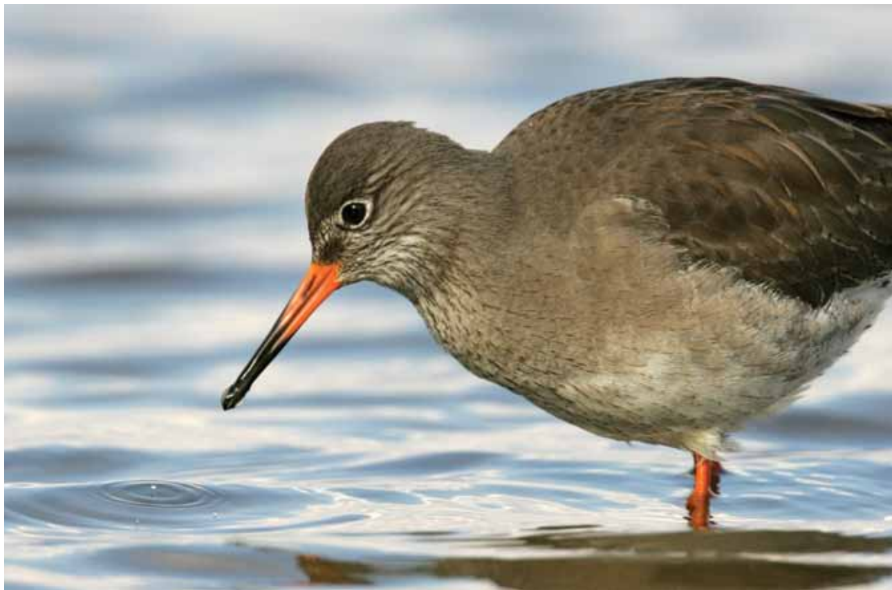
The proposed site is on intertidal sand flat habitat and would destroy much of the Portencross Coast SSSI, a nationally designated wildlife site which supports large numbers of wintering birds such as redshank.

! Co-firing with biomass would not only result in negligible carbon emissions savings but is also contrary to Government policy on the utilisation of biomass