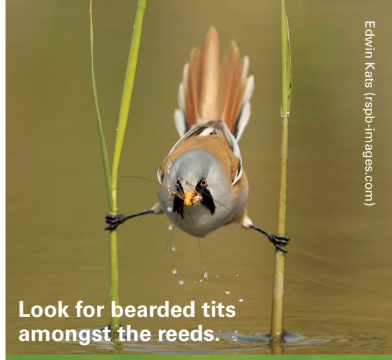
Look for bearded tits amongst the reeds.

Look for elegant great crested grebes on many of the pools, and reed buntings around the edges. In spring, head past the Lock to the spectacular reedbeds for your best chance of finding bitterns. Watch for herons stalking the shallows or a skylark soaring skywards. You might hear the "pinging" calls of bearded tits from the trailside canal.