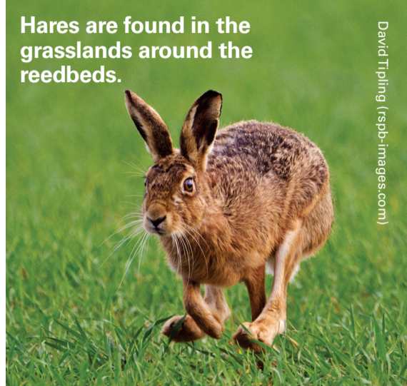
Hares are found in the grasslands around the reedbeds.