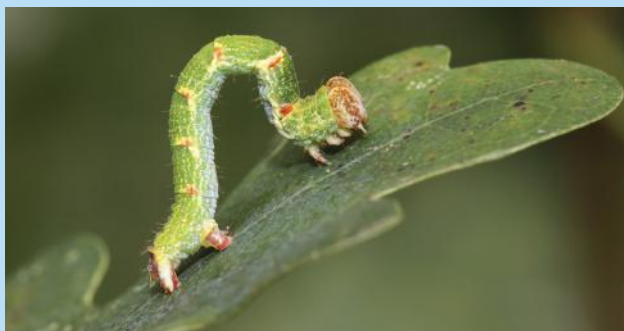
Moth caterpillar on leaf