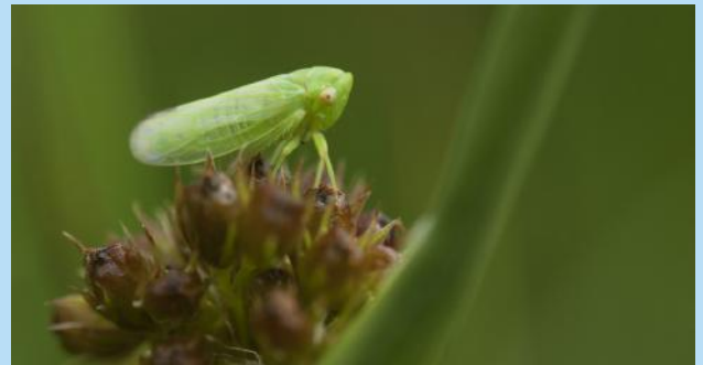
Llyffant y gwair

Gweithgaredd Ysgrifenna atom ni i ddweud beth welaist ti wrth ysgwyd coeden.