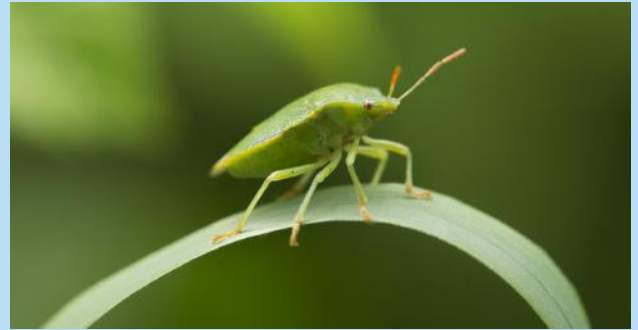
Pryf tarian wyrdd