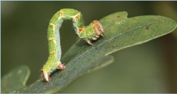
Lindysyn ar ddeilen